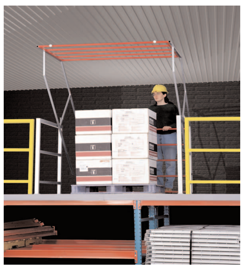
U.S. PATENT NO. 5,546,703