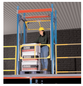
Rack-Supported Safety Gate

The company designed a Rack-Supported version of its Roly Safety Gate that is ideal to incorporate into the pallet-rack pick modules of distribution centers. The Rack-Supported Safety Gate, also referred to as the economy model, is able to save both space and cost by utilizing standard rack components as its framework. This two-gate system consists of formed channels that attach directly to rack uprights. As a result, the manufacturer is able to reduce cost by using existing components while allowing the end user to utilize virtually all of the existing pallet drop area. The Rack-Supported Safety Gates are currently