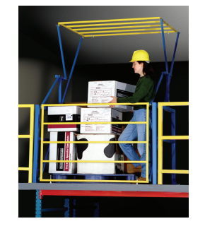
The High Pallet Pivot Gate can handle pallet loads of up to 80 inches.

After talking with customers about applications with a minimum amount of height clearance, Mezzanine Safeti-Gates designed the Pivot Model Safety Gate. While maintaining the integrity of a two-gate system, this model requires less overhead space and uses fewer moving parts than the Roly model. The company's High Pallet Pivot Model is similar to the Pivot Model, but can accept extra-tall pallet loads of up to eighty inches (80"). The High Pallet Pivot gate was created after Cardinal Health asked Mezzanine Safeti-Gates to create a gate that could handle ranging heights of pallet loads (see the Cardinal Health case study for more information). The pivot models can be manufactured out of painted steel, aluminum or stainless steel. The ability to construct the gates out of these materials and their few moving