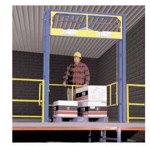
The Tri-Side Safety Gate is ideal for platforms limited in depth.

virtually any materials handling application. Our dual-gate safety devices allow pallets to be removed from ninety-degree angles, while others can be integrated with conveyor lines. Some of our units require little overhead clearance, while others take up a minimal amount of depth on the platform. All of this is accomplished while maintaining the integrity of a two-gate system. No single-gate system comes close to offering the same degree of protection. In addition, all of our products have a standard design that meets the appropriate OSHA codes with optional designs that meet the appropriate BOCA codes."